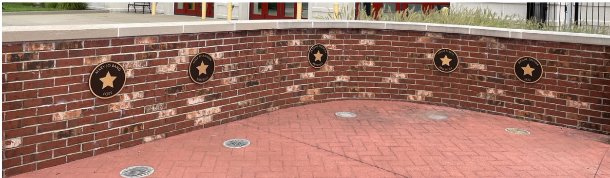
The image above shows the Firehouse side. At the bottom of the article is the Police side.

Back, in the early days of these articles, we did an article on the Ferguson Wall of Fame (December 2021). The article was brief and lacked photographs so we have decided to do an update. The Wall of Fame is located between the Ferguson Firehouse and the Ferguson Police Department. The Wall was dedicated on November 28 th , 2010 (at that time it was Caboose Park).