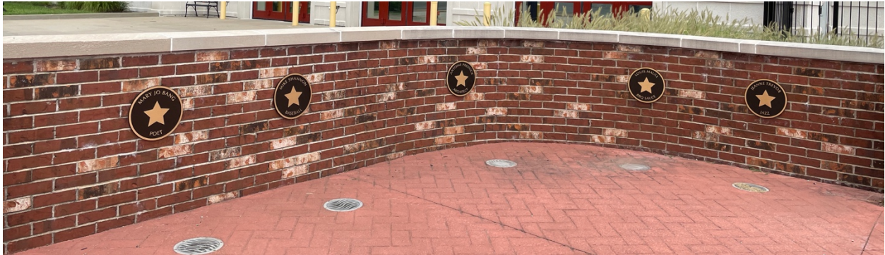
The image above shows the Firehouse side. At the bottom of the article is the Police side.