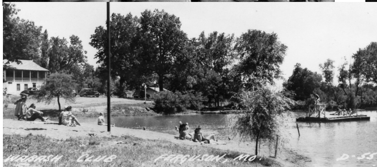
Photo to the left shows a view of the lake and clubhouse in the 1930's. Below, we will show some composite pages from the two Souvenir books on file at the History House.