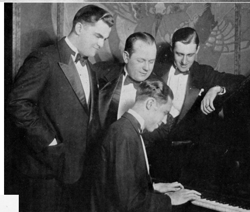
WABASH BANNER BLUE BIRDS