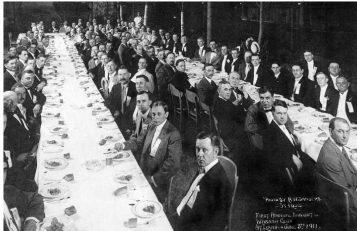
21 1924 First Annual Dinner - Wabash Club St. Louis - June 27 1911.