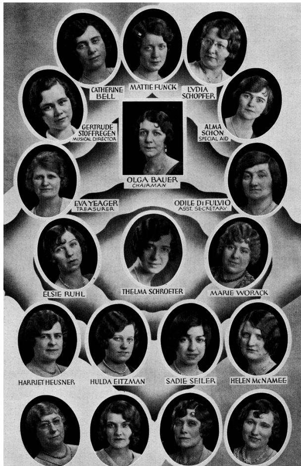
"THE WABASH BANNERS 1922"

outside teams (Men's baseball for example). There were social activities (Dramatics, concerts, social dinners and picnics, etc).